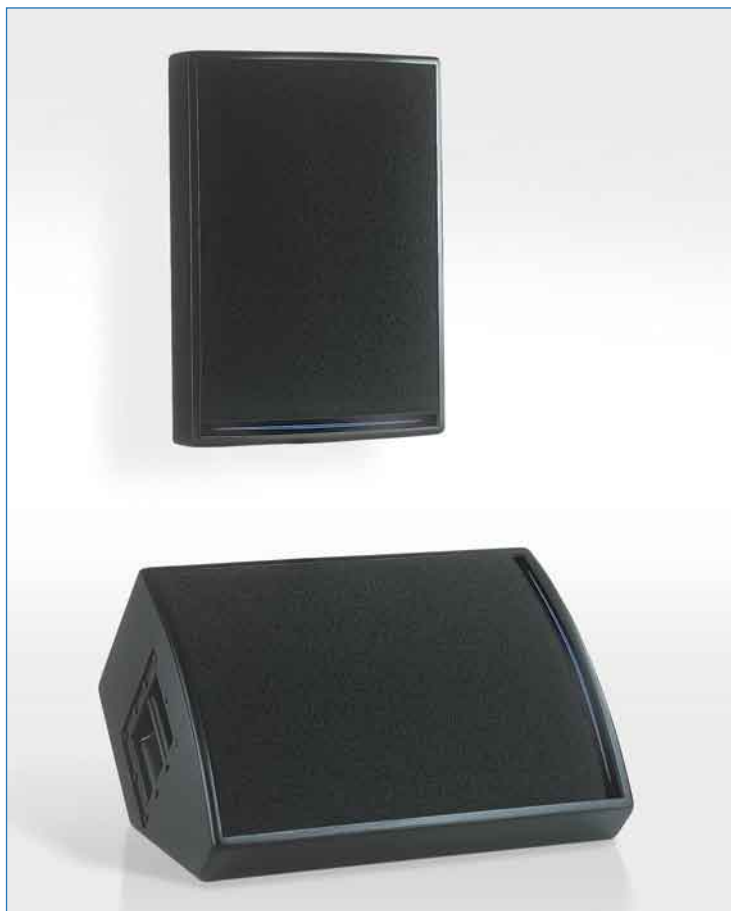
DS15S shown in FOH and stage monitor settings

The DS15S offers total flexibility between stage monitor and F.O.H applications, with or without subwoofers. It stands out by its high efficiency and high dynamic capacity that creates an acoustic pressure/size ratio very uncommon on the market with peak level up to 136 dB SPL. The DS15S is recommended for large size areas and as delay complements in large P.A. systems.