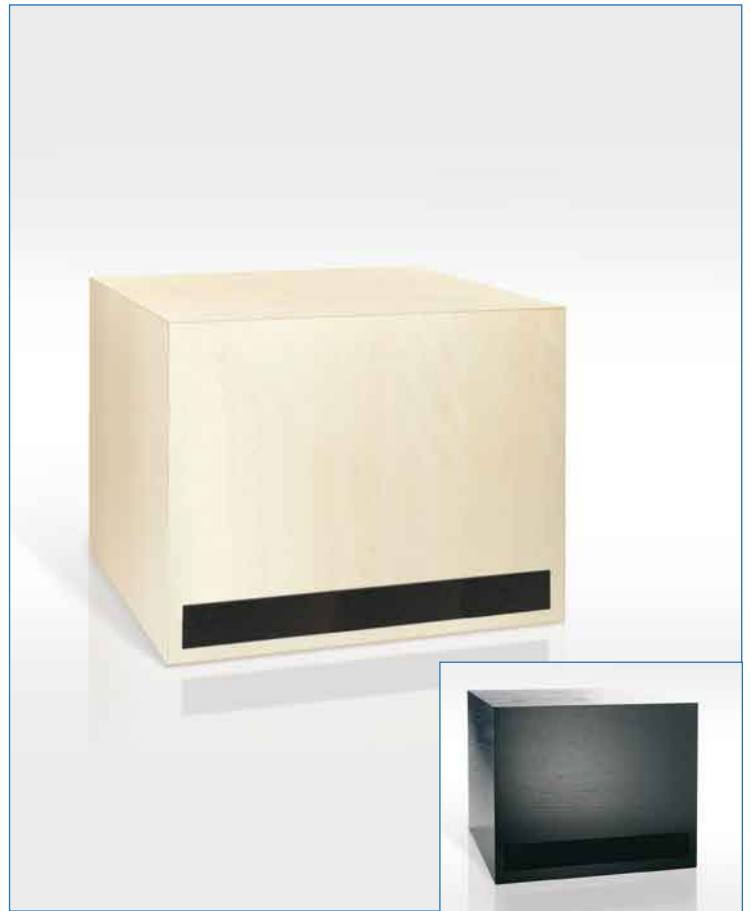
SUB12MX loudspeaker shown with natural varnish wood (SUB12MX) and black varnish wood (SUB12MXN) finish

The SUB12MX has been developed as a low frequency complement for the MX1 or MX2. With its classic "Hi-Fi" finish style, it is dedicated to high standard indoors installations where modern design must be taken into consideration. Thanks to its compactness it can easily be blended into any architectural environment. Sound systems created with MX1, MX2 and SUB12MX are specifically designed for conference rooms, congress halls, ballrooms, theatres, bars etc.